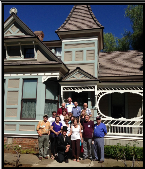
The Happy Wanderers Study Group visiting The Doctor House in Glendale

Have any news, pictures or updates to share? Please email to: alvira@woman-only.com