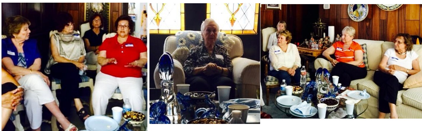
STUDY GROUP listening to Holocaust survivor stories

All proceeds from this event benefit Brandeis University's Sustaining the Mind Fund to foster research in neuroscience and neurodegenerative diseases and to endow science scholarships.