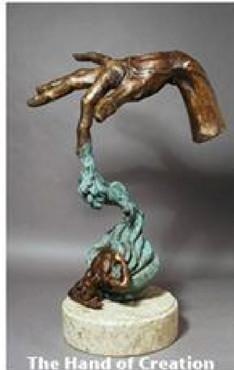
The Hand of Creation

He is sometimes called the "bad boy of Judaism," because of his provocative Bible Series of bronze sculptures that includes the depiction of many controversial themes, such as the first recorded hermaphrodite, "Adam/Eve."