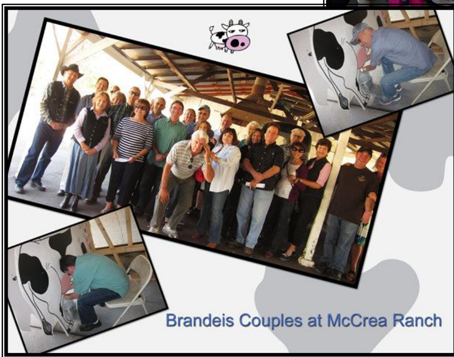
Brandeis Couples at McCrea Ranch

OnTheTown Couples visited Joel and Frances McCrea Ranch in Thousand Oaks where we learned about the family history and their simple life on the ranch away from glamorous Hollywood where both Joel and Frances worked.