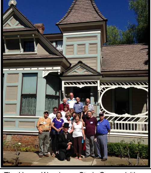
The Happy Wanderers Study Group visiting The Doctor House in Glendale

Have any news, pictures or updates to share? Please email to: alvira@woman-only.com