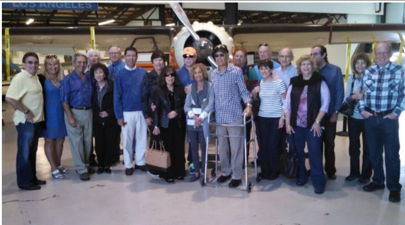
Gadabouts (couples on the town group) in Santa Monica Airport

Have any news, pictures or updates to share? Please email to: alvira@woman-only.com