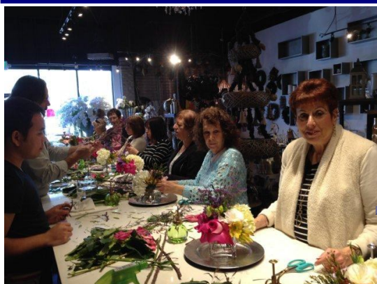
Daytime Trotters at flower arranging class at Luna Gardens in Westlake Village.

Loan inquiries and applications in states where I am not licensed will be referred to a Loan Officer who is licensed in the property state. Prospect Mortgage is located at 15301 Ventura Blvd., Suite D300, Sherman Oaks, CA 91403, 800-464-2484. Prospect Mortgage, L.L.C. NMLS ID #3296, ( www.nmlsconsumeraccess.org ) is a Delaware limited liability company, licensed by the Department of Business Oversight under the California Residential Mortgage Lending Act. This is not an offer for extension of credit or a commitment to lend. Rev 7.28.15 (0615-2230C) LR 2015-474A.