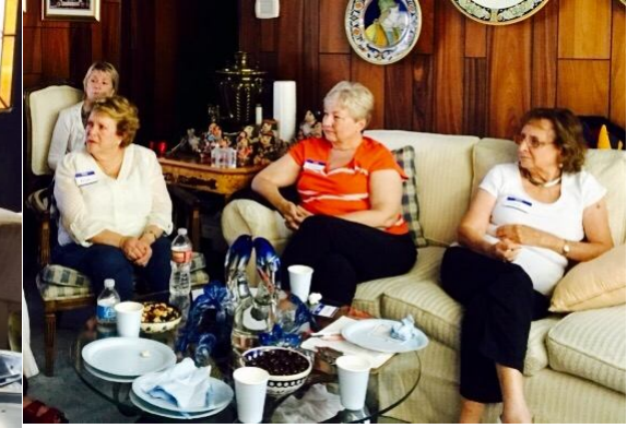
STUDY GROUP listening to Holocaust survivor stories