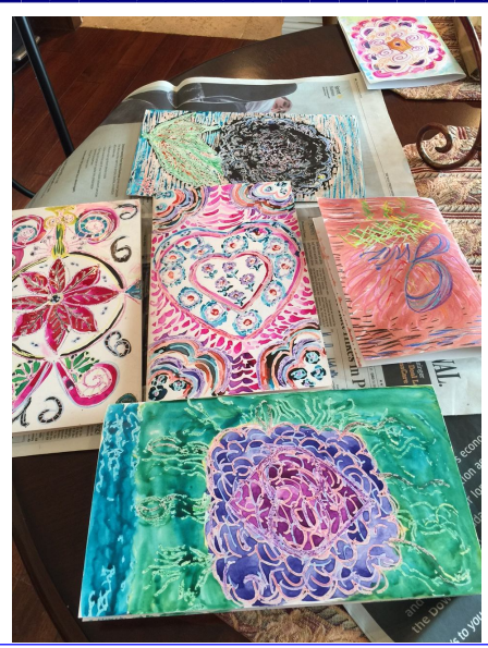
Memoir writers learn Crayon Resist with water colors as an illustration technique. We had a joyful morning.