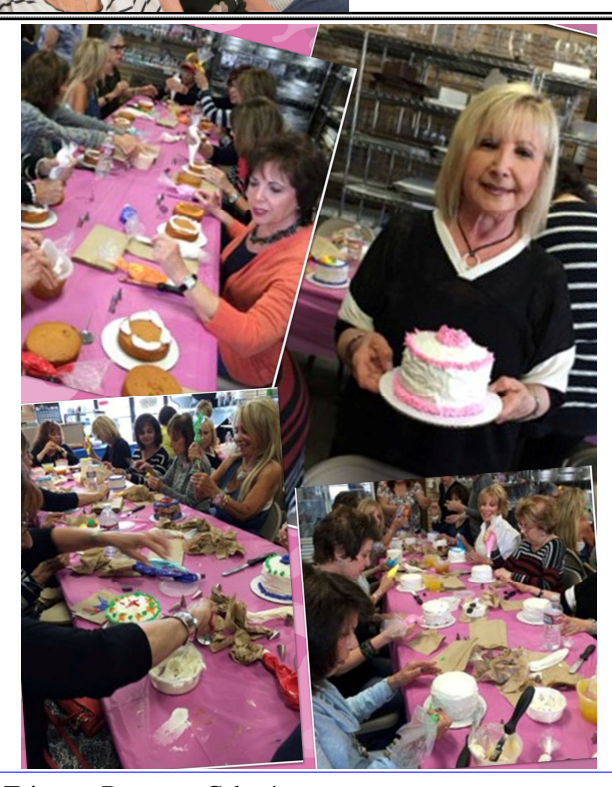
Day Trippers Decorate Cakes!

On June 11, 2015 our group met at Catherine's Cake Decorating and Candy Supplies in Chatsworth, to take a class in the art of Cake Decorating. We want to share with you our fun-filled day. Cake decorating with your friends is joyful and a strong sharing adventure. Each of us took home our beautifully decorated cakes to share with our families.