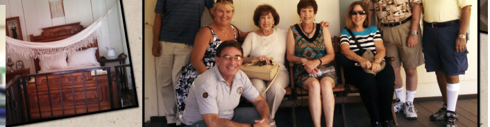
Sunday Couples Group visiting Leonis Adobe

<<< Divas at Murphy Auto Museum in Oxnard